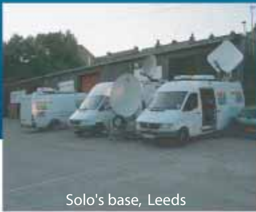
Solo's base, Leeds